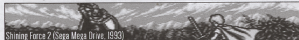
Shining Force 2 (Sega Mega Drive, 1993)